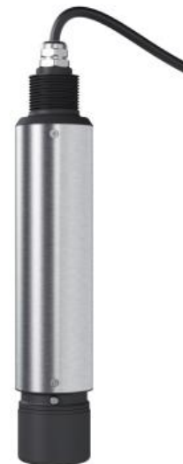
Fluorescence Dissolved Oxygen Electrode