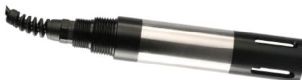
Dissolved Oxygen Sensor (Replaceable membrane head)

The measurement value is correct or not, have a great relationship with the measuring electrodes, therefore, the maintenance of measuring electrodes is very important for the measurement system.