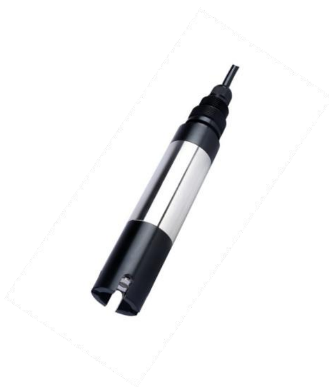
SUP-DO-7011 Dissolved Oxygen sensor

SUP-DO-7011 type oxygen electrode with high stability and stress resistant, can be used in a more harsh environment, maintenance volume is smaller, suitable for urban sewage treatment, industrial wastewater treatment, aquaculture and environmental monitoring and other fields of continuous measurement of dissolved oxygen.